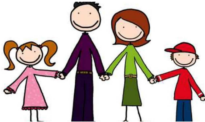
PHOTO SESSIONS for our new Church Directory will be THIS week. We have fewer than 25 families signed up. Please contact the office to arrange a time. Our photographer will be here:

Tuesday 1pm – 9pm, Wednesday 10am – 5pm, Thursday 3pm – 9pm, Friday 1pm – 9pm and Saturday 10am – 6pm.