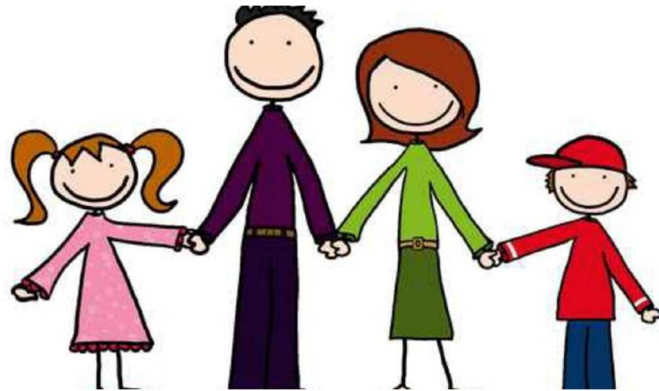
PHOTO SESSIONS for our new Church Directory will be THIS week. We have fewer than 25 families signed up. Please contact the office to arrange a time. Our photographer will be here:

Tuesday 1pm – 9pm, Wednesday 10am – 5pm, Thursday 3pm – 9pm, Friday 1pm – 9pm and Saturday 10am – 6pm.