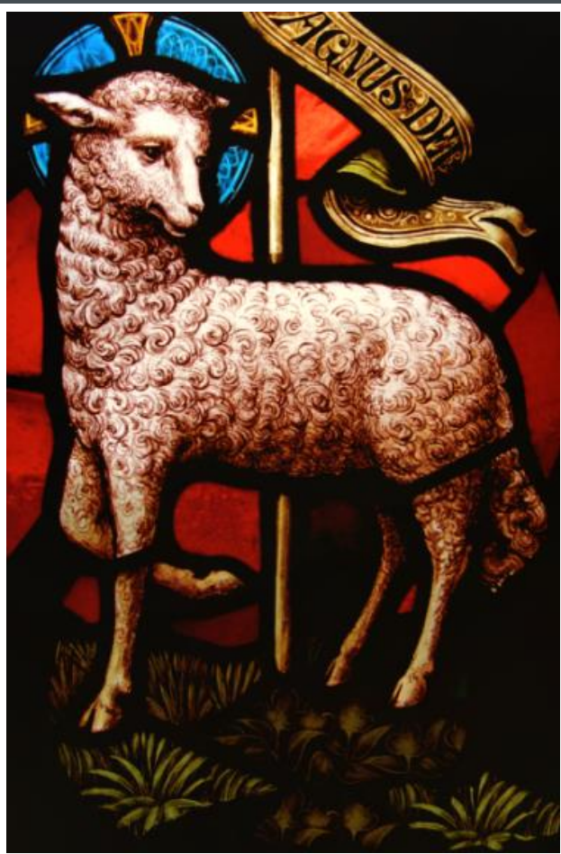
"Behold the Lamb of God."