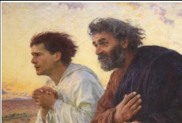
The other disciple ran faster than Peter and arrived at the tomb first.

If you know of someone to be added to the prayer list or is homebound that would like a visit please email or call the office.